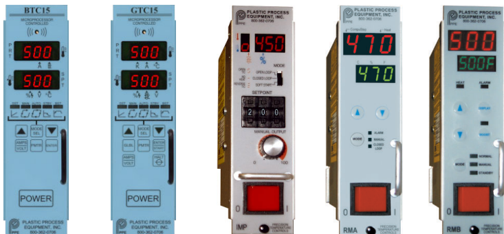
BTC15 GTC15 IMP15 RMA15 RMB15