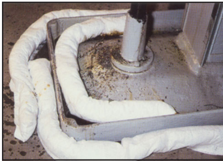
DIKES - SOCKS

SPILFYTER® Dikes-Socks are ideal for soaking up non-aggressive fluids, oils, and other petroleum products. Their moldable shape easily conforms to fit around equipment, drums, tanks, sinks, or walkways. They are pure cellulose fibers in a propylene cover. No Dust!