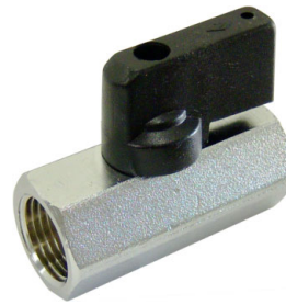
FEMALE X FEMALE

PPE industrial quality, one piece brass bar stock design Mini Brass Ball Valves provide the space savings necessary for small line fluid control applications. Designed for handling compressed air, water, fuels, gases, and other non-corrosive liquids in industrial applications that require compact ball valves. Top-of-the-line features include 235psi MWP Rating, PTFE ball seats for a positive seal in both directions, Viton stem seal, chrome plated brass ball and body for long life and extra corrosion resistance, bottom loaded stem for safety. Corrosion resistant nylon wing handle is compact, easy to use, and clearly shows ball position. Each valve is leak tested to ensure quality. Valve body functions as wrench flats for easy installation.