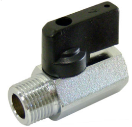
MALE X FEMALE