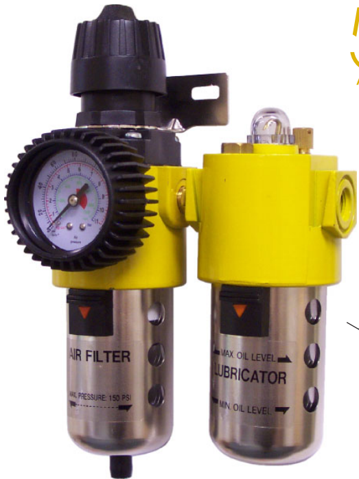
Filter/Regulator (2.5 lbs)