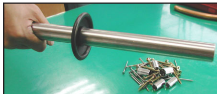
2. Ready for use.