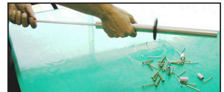
4. To clean, retract plunger with magnet and metal stops against part shield.