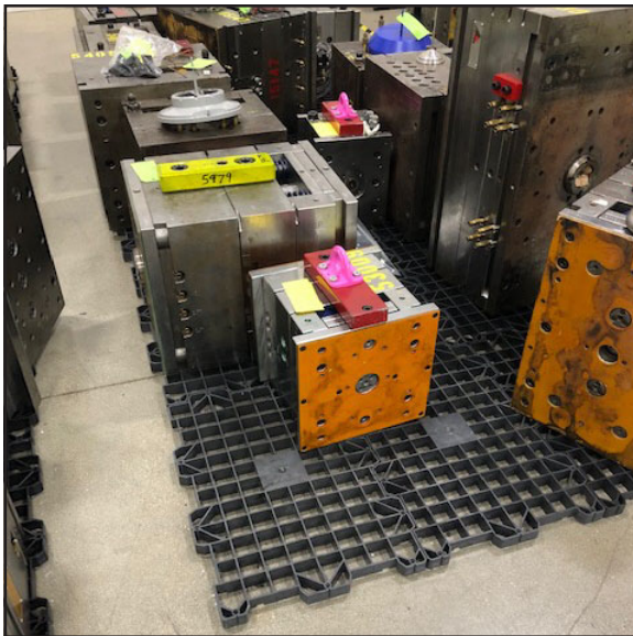
Mold Mats used for long term mold storage.