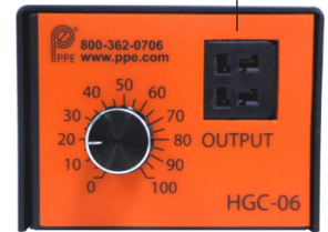
HGC-06 SOLID STATE TEMP. CONTROL 120/60/1

Fuse Types used: Old Style (silver box): AGC-1 New Style (black box): GMA-1