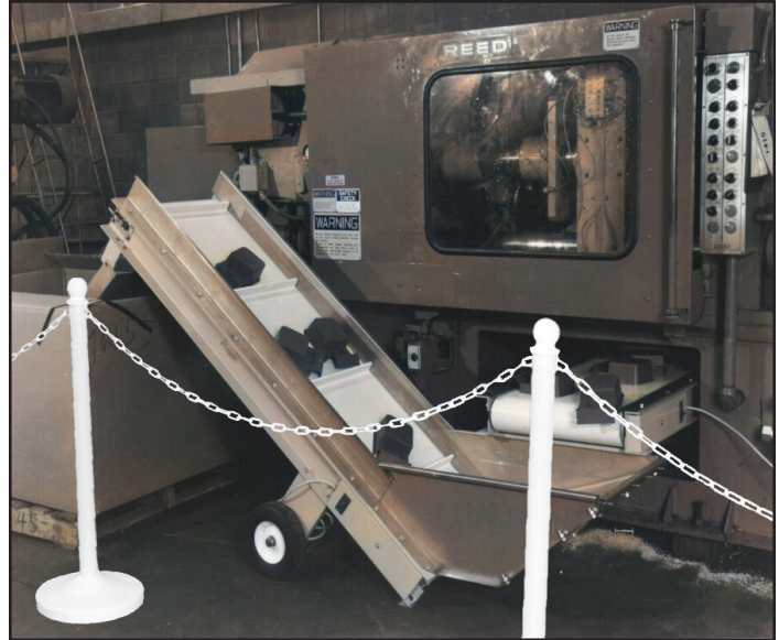
STANCHIONS CAN BE USED TO GUIDE PERSONNEL AROUND MACHINERY IN OPERATION.