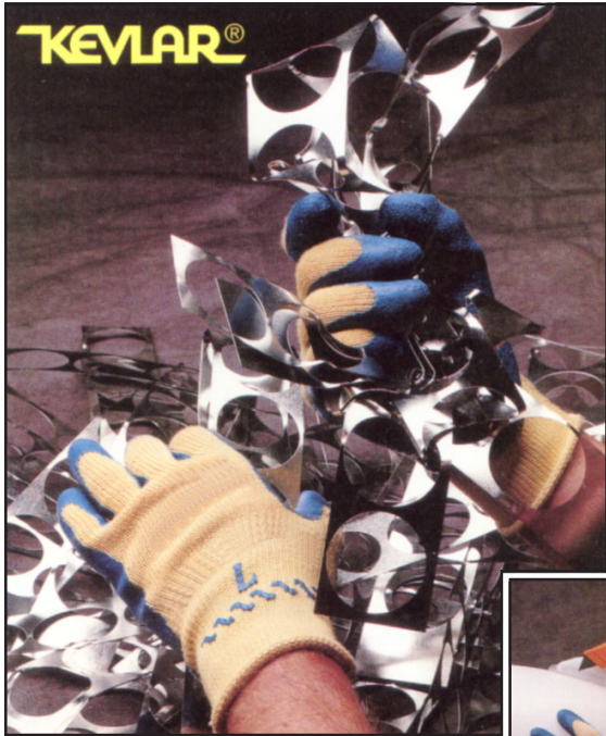
Textured natural rubber palm coating has excellent wet and dry grip!