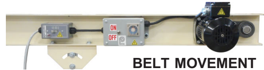
BELT MOVEMENT ON-OFF CYCLING TIMER