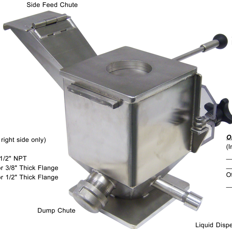
Slide Gate (shown closed) Front mount only.

* For Round Throat opening list "E" as diameter and leave "F" blank.