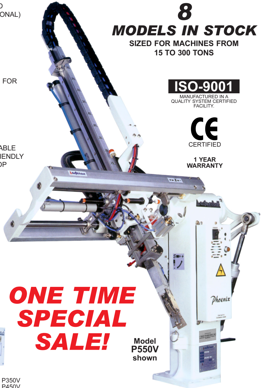
Model P550V shown