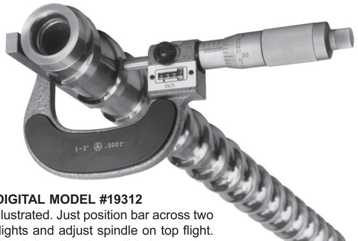
DIGITAL MODEL #19312

We suggest buying the precision digital outside micrometer because you can't make a mistake when you read it.