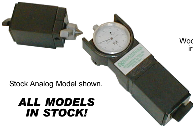
Stock Analog Model shown.

FOR 100+ TON MACHINES Requires 14" clear bar space Will fit 2" dia. or larger tie bars.