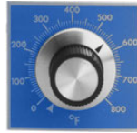
Remote Setpoint Potentiometer (Optional - See Configuration Codes "B" & "E" below)