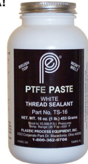
TS-16 (1 Pound)