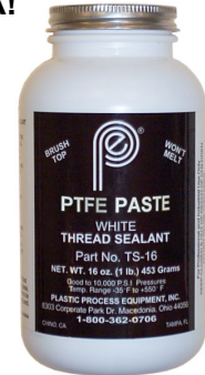
TS-16 (1 Pound)