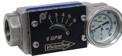
Dimensions: 1.50" H x 2.84" D x 3.75" L