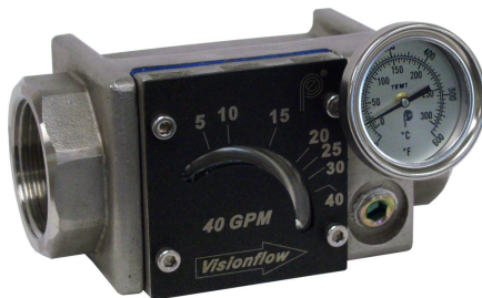
Dimensions: 2.60" H x 3.50" D x 3.92" L