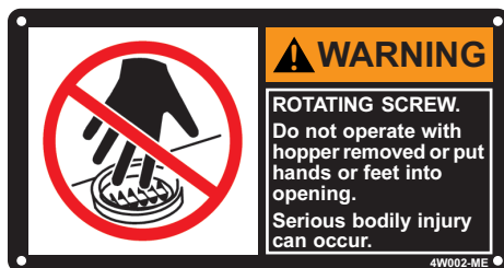
Poly Part No. 4W002-LE