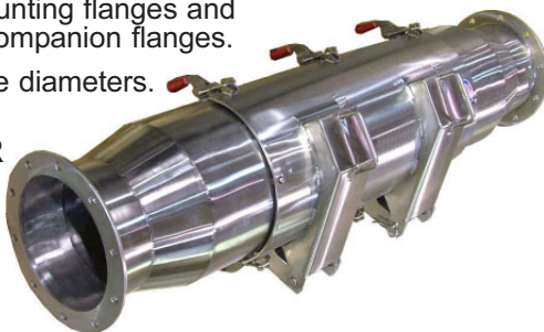
SHOWN WITH SPECIAL MOUNTING FLANGES