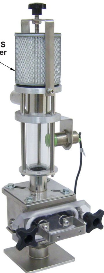
PPE Model LV-50S Venturi Loader shown

OUR QUALITY PRODUCTS AND FAIR PRICES SAYS IT ALL!