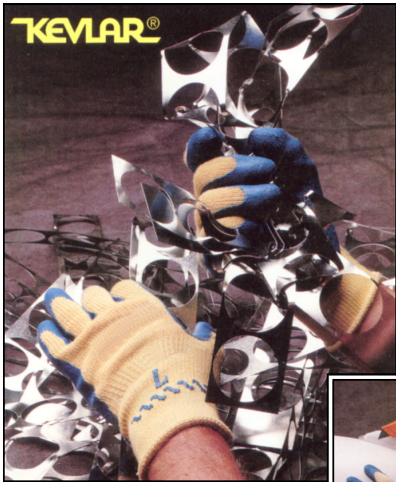
Textured natural rubber palm coating has excellent wet and dry grip!