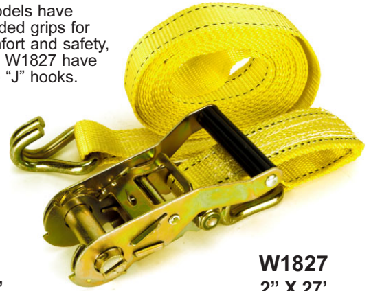
W1827 2" X 27'