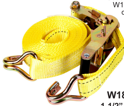
W1826 1-1/2" X 15'