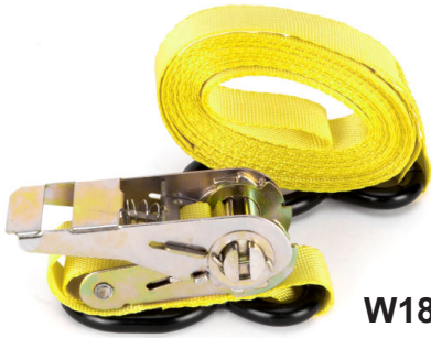
W1851 1" X 15'

All models have overmolded grips for added comfort and safety. W1826 & W1827 have double "J" hooks.