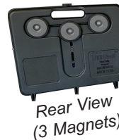
Rear View (3 Magnets)