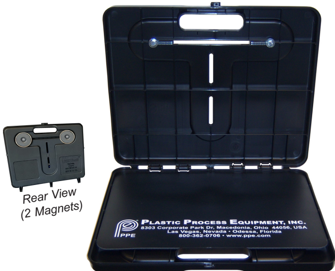
Rear View (2 Magnets)