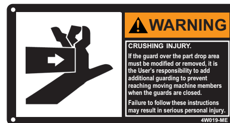
Poly Part No. 4W019-LE