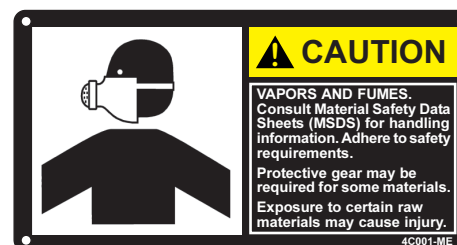
Poly Part No. 4C001-LE