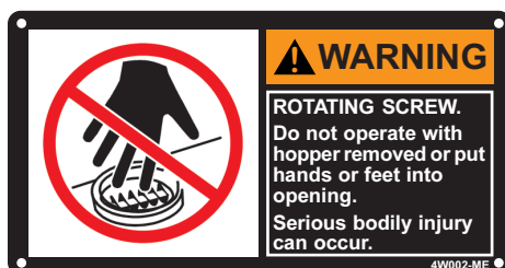
Metal Part No. 4W002-ME Poly Part No. 4W002-LE