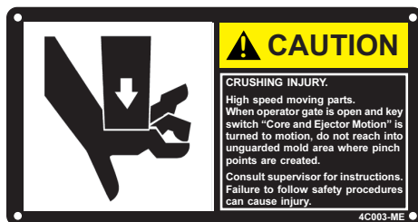
Poly Part No. 4C003-LE