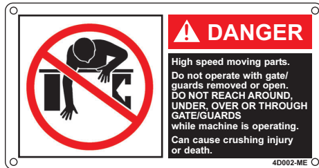
Poly Part No. 4D002-LE