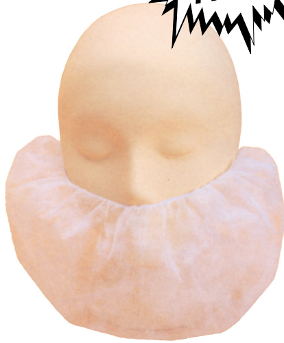
POLY BEARD COVER Part No. 112NW (Domestic) Part No. 113NWF (Import)