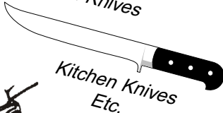
Kitchen Knives Etc.