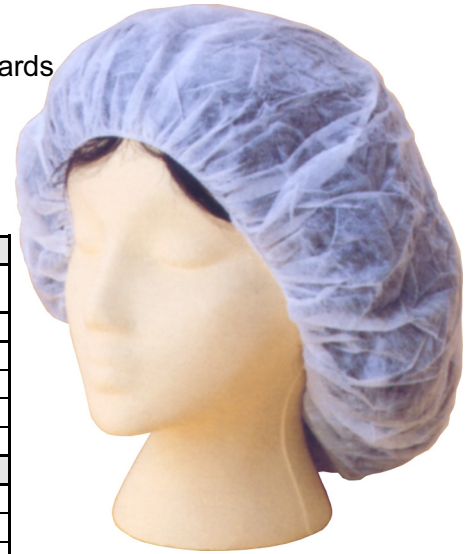
POLY BOUFFANT HAIRNET Part No. 110NW (Domestic) Part No. 111NW (Import)