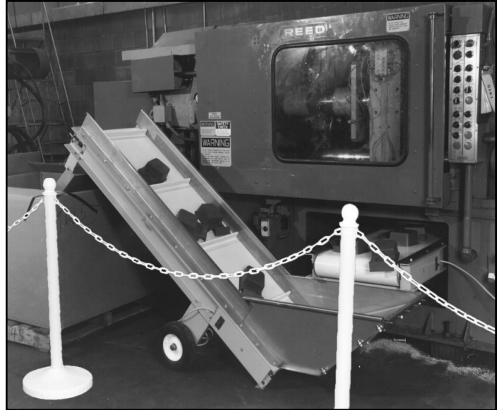
STANCHIONS CAN BE USED TO GUIDE PERSONNEL AROUND MACHINERY IN OPERATION.