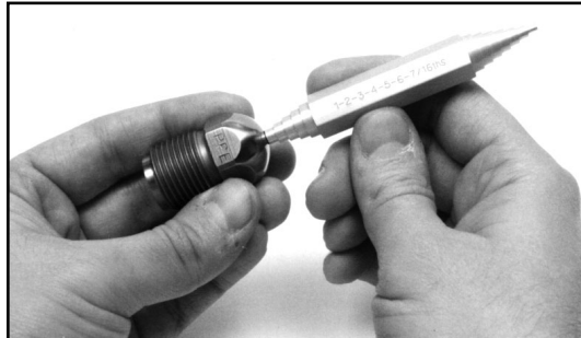
CHECK YOUR ORIFICE