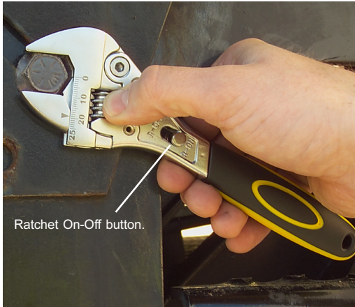
Ratchet On-Off button.