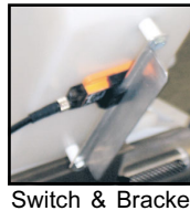
Switch & Bracket