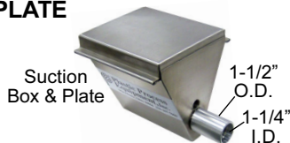
Suction Box & Plate

Stainless Steel Suction Box conveys material out of Material Storage Bins. Requires cutting or drilling by customer. Part No. 200206 ..... $300.00 ea.