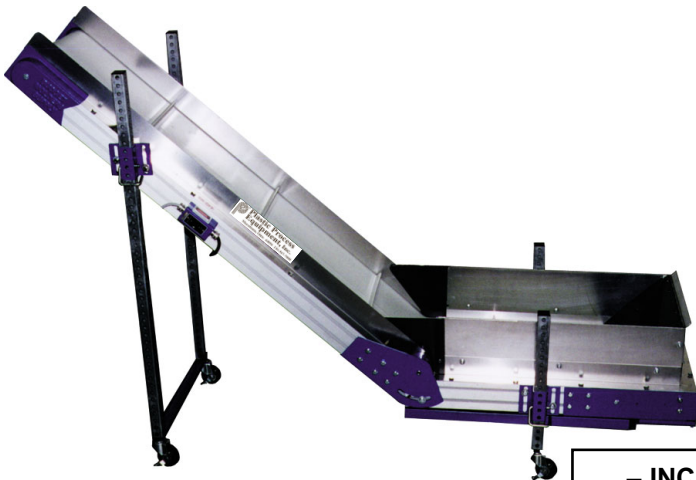
VARIABLE INCLINE CONVEYORS