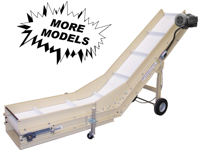
FIXED INCLINE CONVEYORS