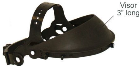
Visor 3" long