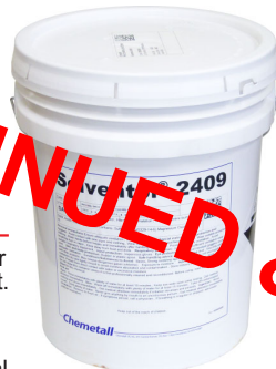
SOLVENTOL® 2409 Acid (powder - 45 lbs.)

CAUTION: Always follow chemical suppliers instructions. Always wear safety equipment!