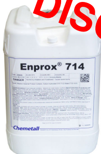
ENPROX® 714 Neutralizer (liquid - 37 lbs.)