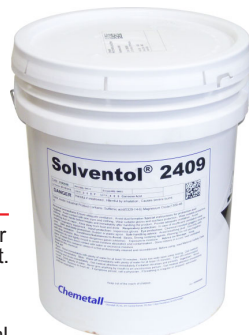
SOLVENTOL® 2409 Acid (powder - 45 lbs.)

CAUTION: Always follow chemical suppliers instructions. Always wear safety equipment!