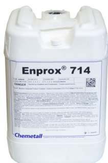
ENPROX® 714 Neutralizer (liquid - 37 lbs.)