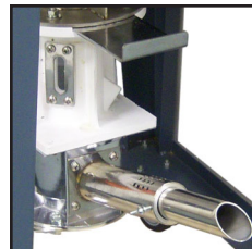
Suction Box available.