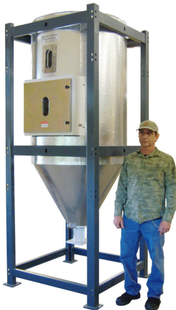
Model DH-750-USD shown 775lb. Capacity

Discharge Chute Flange Plate: Top 7-3/8" dia. with 4 holes 3-7/8" on center. Bottom plate 6-1/4" x 6-1/4" square undrilled. See table for bottom opening sizes.