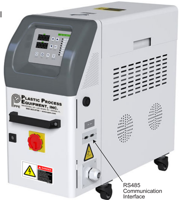
RS485 Communication Interface