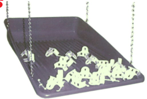
Molded Part Drop Trays supplied with 6 ft. of steel chain and eight eye bolts.

OPAQUE MATERIAL FDA COMPLIANT IN TITLE 21 CFR 177.1520