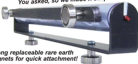
Strong replaceable rare earth magnets for quick attachment!