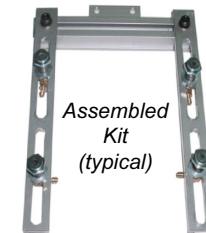
Assembled Kit (typical)