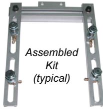
Assembled Kit (typical)