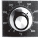
Remote Setpoint Potentiometer (Optional - See Configuration Codes "B" & "E" below)