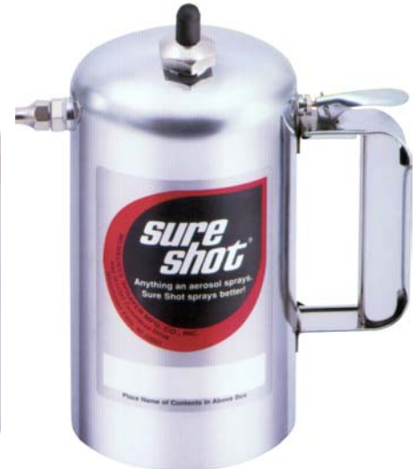
1000 & 2000 Models

ALL 8000 MODELS COME WITH A SPARE B15 & B14V AND NINE (9) SPRAY BUTTONS.