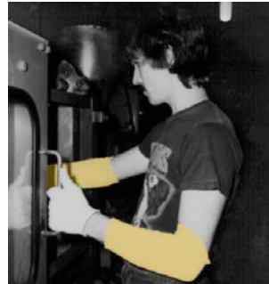
ILLUSTRATED 12" LONG SLEEVES

A combination of Kevlar® outer shell with a 100% cotton lining to absorb perspiration keeping arms cool and dry all day.