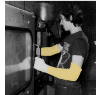
ILLUSTRATED 18" LONG SLEEVES

All types come plain or with thumb and finger holes for extra protection for knuckles and palms plus thumb hole keeps sleeve from riding up your arm. 18" & 24" models only.