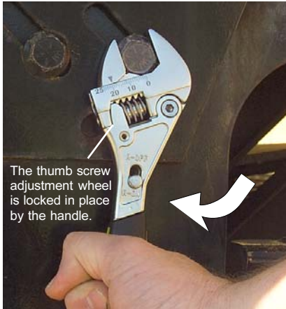
The thumb screw adjustment wheel is locked in place by the handle.