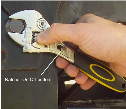
Ratchet On-Off button.