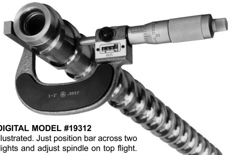
DIGITAL MODEL #19312

We suggest buying the precision digital outside micrometer because you can't make a mistake when you read it.