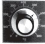
Remote Setpoint Potentiometer (Optional - See Configuration Codes "B" & "E" below)