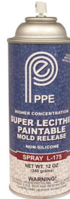
SUPER LECITHIN PAINTABLE Mold Release L-175