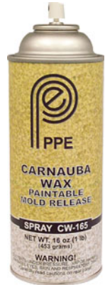
CARNAUBA WAX PAINTABLE Mold Release CW-165

OUR FORMULAS ARE CURRENT AND CONFORM TO STATE AND FEDERAL REQUIREMENTS. MSDS SHEETS SENT ON REQUEST