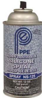
NON-FLAMMABLE SILICONE SPRAY Mold Release NS-125

MANUFACTURED IN A QUALITY SYSTEM CERTIFIED FACILITY.