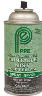
NON-FLAMMABLE PAINTABLE MIST Mold Release NP-121