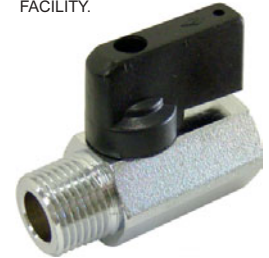
MALE X FEMALE