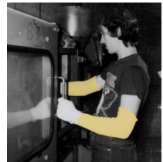
ILLUSTRATED 12" LONG SLEEVES